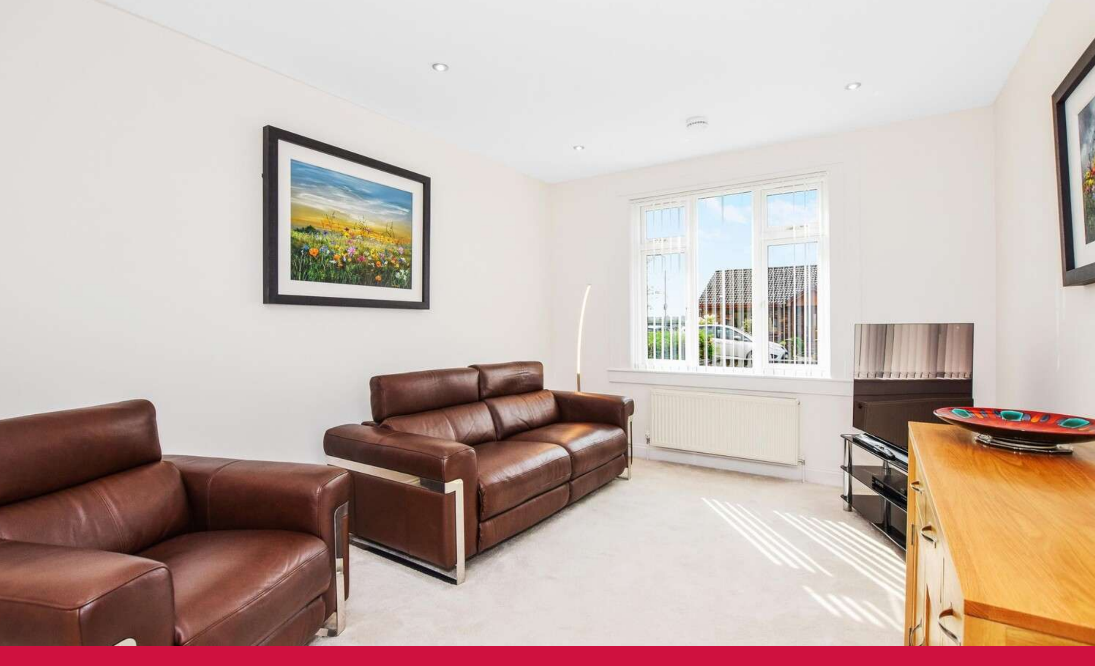
Ross & Connel are delighted to bring to the market this stunning extended semi detached villa offering the superb family accommodation of outstanding quality throughout and located in a much sought after area. Large reception porch/sitting room, Hall, Lounge, Dining room, Luxury kitchen, Utility room. Shower room, 4 Double bedrooms, Family bathroom. Double glazing. Gas central Heating. Large driveway with ample parking for several cars. Double garage. Large, Well maintained and generously proportioned gardens to front and rear. Pristine decor. Immaculately presented. Internal viewing is highly recommended to allow prospective purchasers to fully appreciate the quality of fixtures and fittings and excellent workmanship this home has to offer. EPC Band: C Council Tax - C. Freehold.